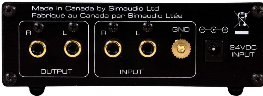
Figure 1: MOON 110LP v2 back panel