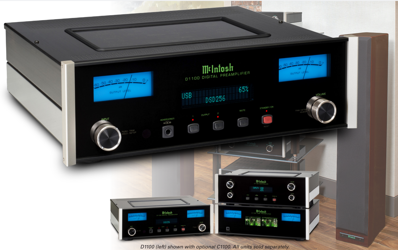
D1100 (left) shown with optional C1100. All units sold separately.