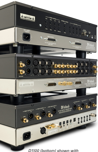
D1100 (bottom) shown with optional C1100. All units sold separately.